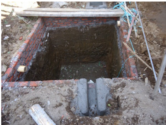
The construction of infiltration ponds in Claket Village, Mojokerto.